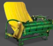
CHAINLESS 2000 LINKAGE FEEDER