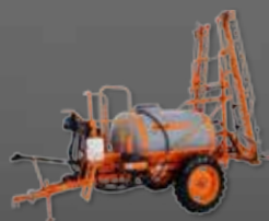
COLUMBIA TRAILED 2000