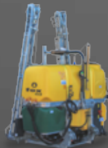
FOX LINKAGE 1200-2000