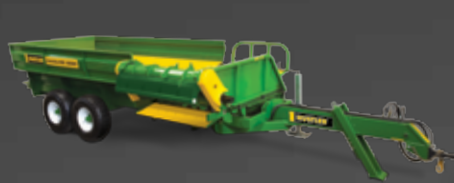
CHAINLESS 8000 TRAILED 4-BALE FEEDER

Our dealer network guarantees technical backup and quick replacement of parts.