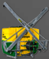
KATIPO LINKAGE 680-1150