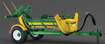
SL700X TRAILED 2-BALE FEEDER