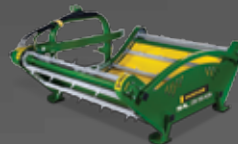
SL350 LINKAGE FEEDER