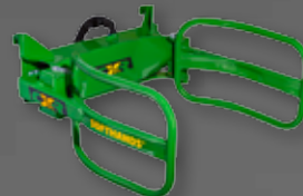
CXR SOFTHANDS FARMER