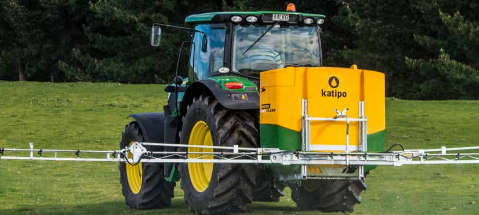
Katipo 1150 with 10 metre hydraulic Sonicboom.

Once bitten you'll be smitten! With farming at our core, and a love for machines our passion - the rethinking of our already successful sprayer range was pure instinct. The revolutionary Katipo for farmers and contractors embodies a raft of new features never seen in agricultural sprayers before - all designed to make your life easier.