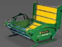
SL450X LINKAGE TROUGH FEEDER