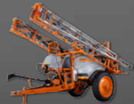
ADVANCE TRAILED 3000