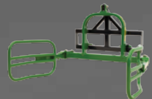
SYSTEM 10 SOFTHANDS FARMER