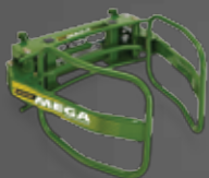
MEGA SOFTHANDS CONTRACTOR