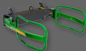
COMPACT SOFTHANDS FARMER