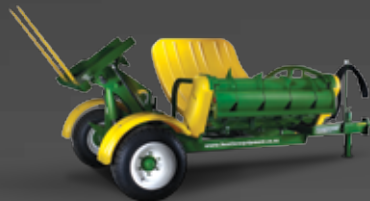
CHAINLESS 4000 TRAILED 2-BALE FEEDER